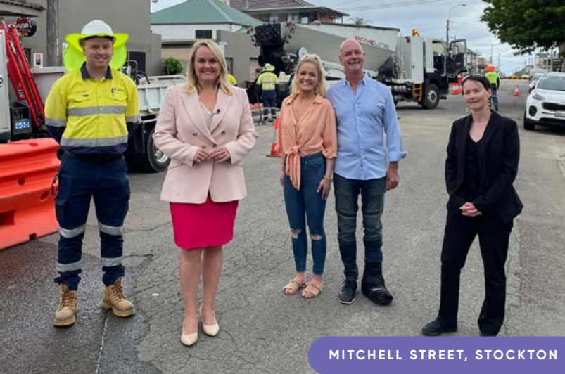
MITCHELL STREET, STOCKTON