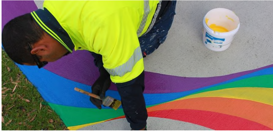
Adding the final touches to the Islington Rainbow walk

City Of Newcastle previously resolved to support marriage equality in a successful Notice of Motion at the ordinary council meeting of 28 July 2015.