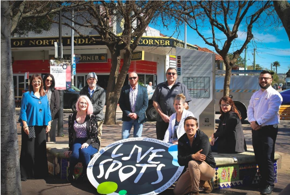
Soft Launch of Live Spots in August 2020

A city-wide collaboration to enhance live music