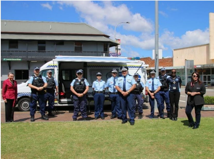
The launch of Business Beat in Wallsend in October 2020

A city wide collaboration to connect local business and local law enforcement