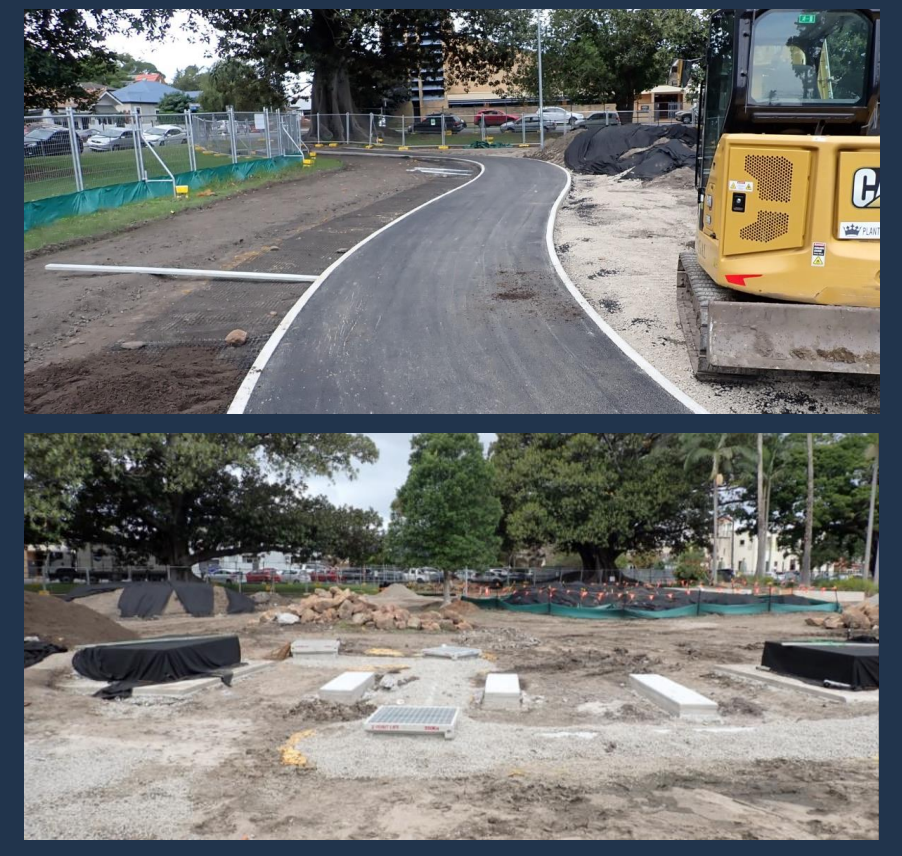
Underway: Gregson Park amenities and playground construction.