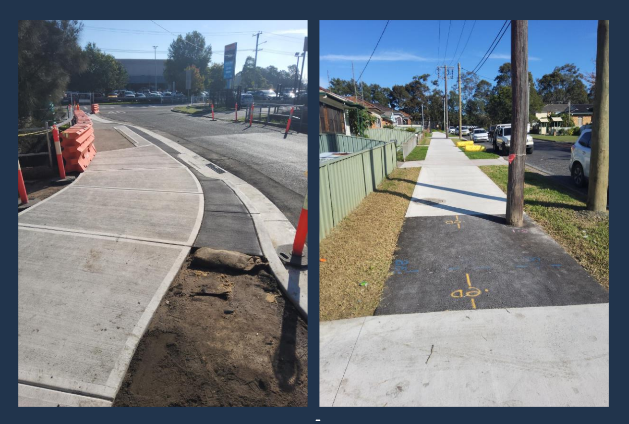
Underway: Construction of shared pathway at William Street Jesmond.

City of Newcastle deliver a range of capital works projects to renew and upgrade city infrastructure. For further information about major projects and works, please see newcastle.nsw.gov.au/works