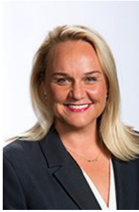
Lord Mayor Councillor Nuatali Nemes