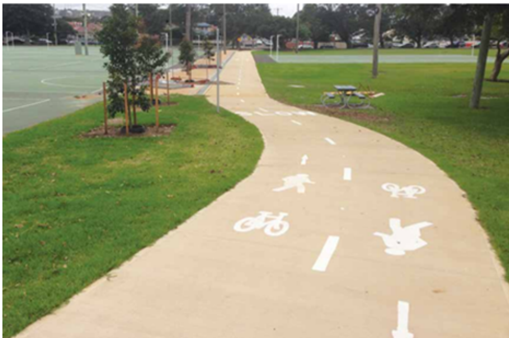
National Park – Newcastle Cycling Plan 2021-2030

I am grateful to the members of the Liveable Cities Advisory Committee for their contributions, that is reflected in the achievements of the Newcastle Council and in the continuing amenity of our great city.