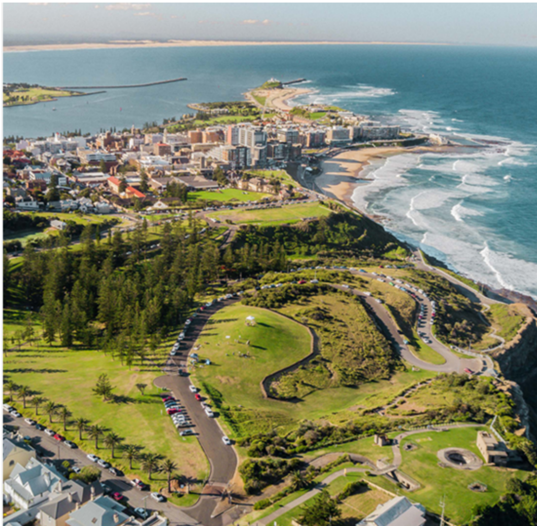
Newcastle Aerial – Newcastle Local Housing Strategy