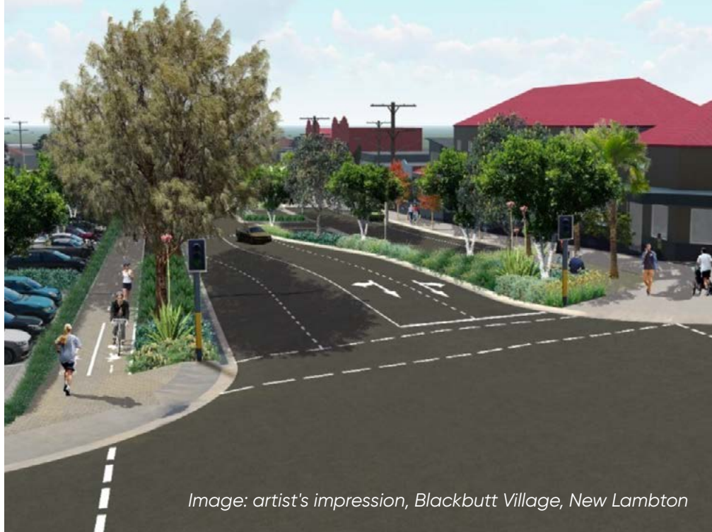
Image: artist's impression, Blackbutt Village, New Lambton