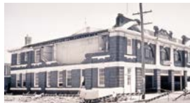
Earthquake damage, Newcastle Ambulance Station, 1989

I Ambulance Station built in 1923 and still a fully operational ambulance station of NSW Ambulance P H