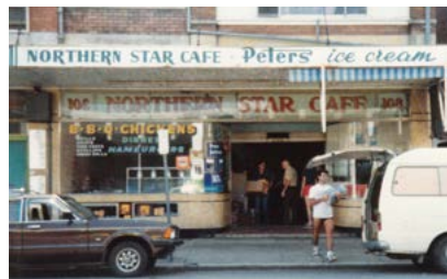
Northern Star Café, mid 1980s

When this café opened in the early 1940s, it offered a typical Australian menu of the times. It was especially popular with men working on Newcastle's industrial sites, and later, students. In the 1980s the Italian owners began responding to customers' interest in homestyle Italian food, which quickly became the signature of this enduring Hamilton café.