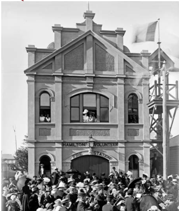
Celebrating the addition of a second storey to the Hamilton Fire Station, 1906

Discover how a 19th century settlement of immigrant coal miners transformed into the vibrant multicultural suburb of Hamilton.