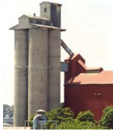
Hamilton mill silos, 1982

C Old Hamilton flour mill the towering silos were a prominent Hamilton landmark until demolished in 1990 after the earthquake P H