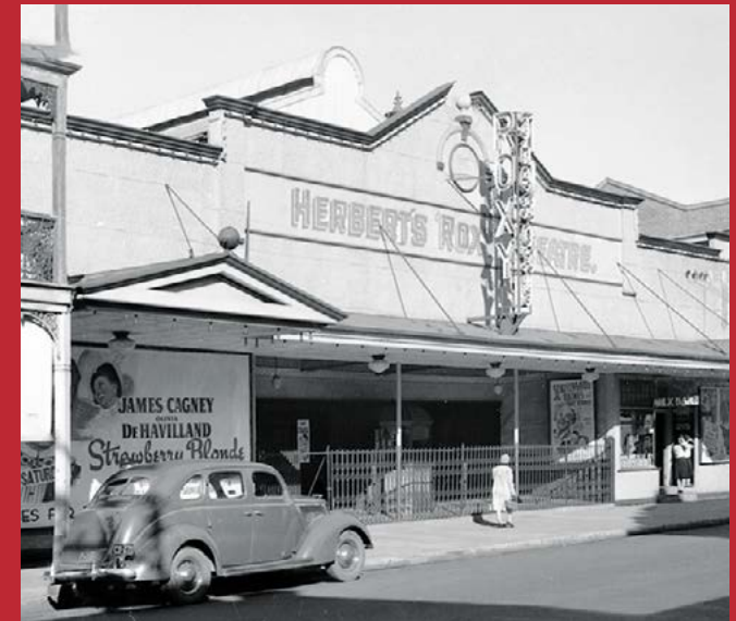
The Roxy Theatre, once at 99–101 Beaumont Street, began as a picture theatre around 1913. It was the home of the Newcastle Dramatic Art Club, from 1955–1971.

Hamilton Chamber of Commerce P O Box 92, HAMILTON NSW 2303 Australia Email: info@hamiltonchamber.com.au Web: http://www.hamiltonchamber.com.au Facebook: https://www.facebook.com/HamiltonNow