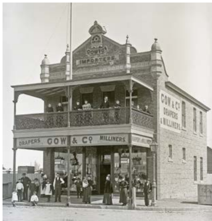
Gow and Co. Store, corner of Beaumont and Cleary streets, Hamilton, 1898