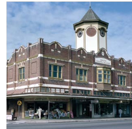
The third Hamilton Municipal building, before the 1989 earthquake

This is the third Hamilton Chambers building. Hamilton Municipal Council was incorporated in 1872 and the first Council Chambers was built in 1880. A second building in 1892 was soon replaced by a third in 1919. The distinctive W R Alexander clock tower was added in 1929. On 31 March, 1938 an independent Hamilton Council met for the last time. Damaged in the 1989 earthquake, the clock tower was reinstated using clock faces and mechanisms from the original structure. The building was substantially rebuilt and the James Street plaza created at this time.