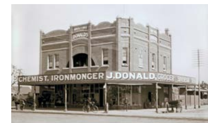
Donald's Chemist, Grocer and Ironmonger, c.1900