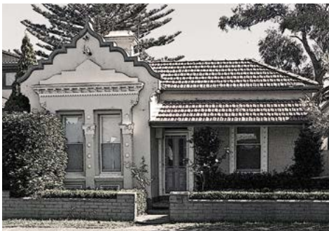
Eddy St Residence

A group of free standing, single storey late Victorian residences is a heritage feature of this short street. Originally built c.1890 to the same design, each has an Italianate façade and an unusual Dutch gable at the front. Despite changes to some of the houses, most of the design features have been preserved.