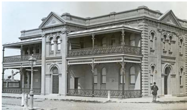
Mechanics Institute, Hamilton, 1892