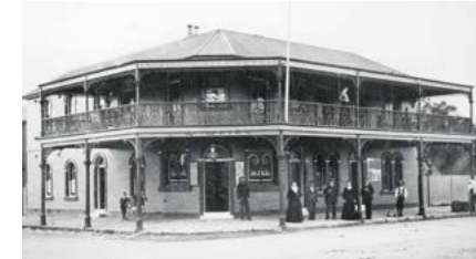
The Northern Star Hotel with balcony, early 1900s

Built in 1877, this is the earliest Hamilton hotel still in existence on the same site, and with the same name. A major redevelopment in 1969 saw much of the existing building, including the cast iron lacework balcony, demolished. In 2016, two generations of the Ramplin family celebrated 30 years as owner-operators of the hotel.