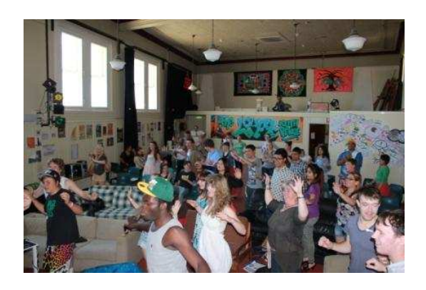
The Commonwealth government Regional Development Australia fund is also contributing to the redevelopment.

As the custodian of one of NSW's most substantial public art collections outside capital cities, the Newcastle Art Gallery's exhibition program has been extensive and varied. The value of the growing collection to the community has been evidenced by the substantial contributions from individuals, groups and all levels of government to enable the redevelopment of the Art Gallery.