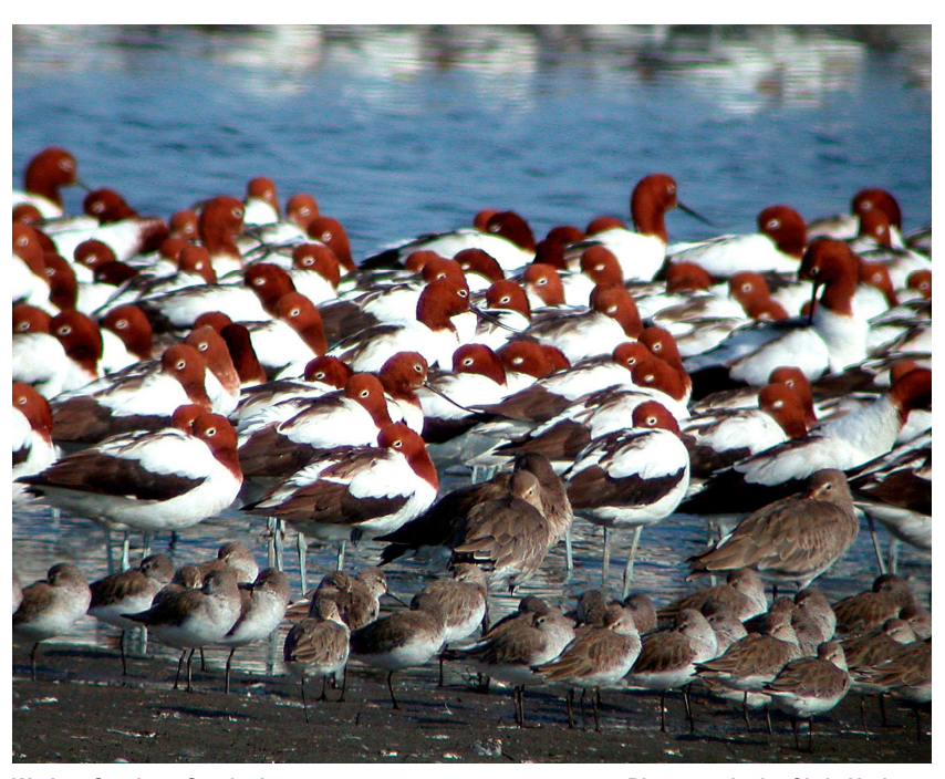
Waders Stockton Sandspit

For more information on migratory shorebirds visit the Hunter Bird Observes Club website www.hboc.org.au.