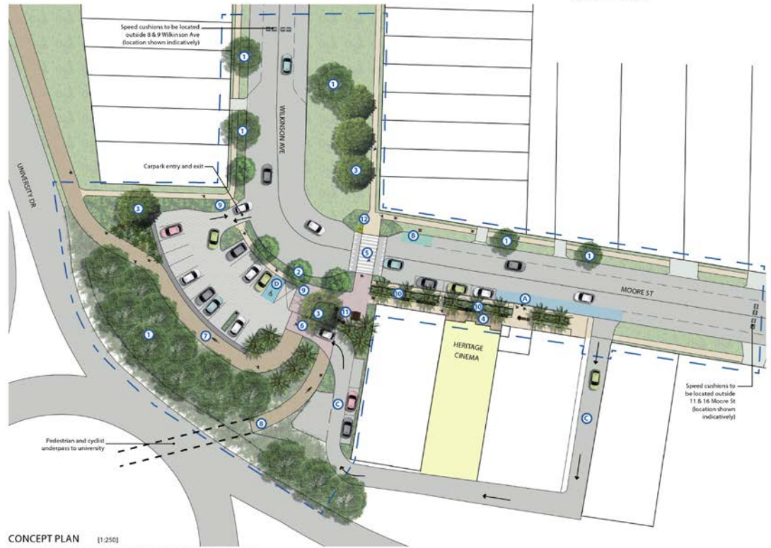
CONCEPT PLAN [1:250] These plans have been produced for communication purposes only at concept level and are not detailed civil designs. Final layout will be subject to a detailed design process and investigation of all service and technical requirements.