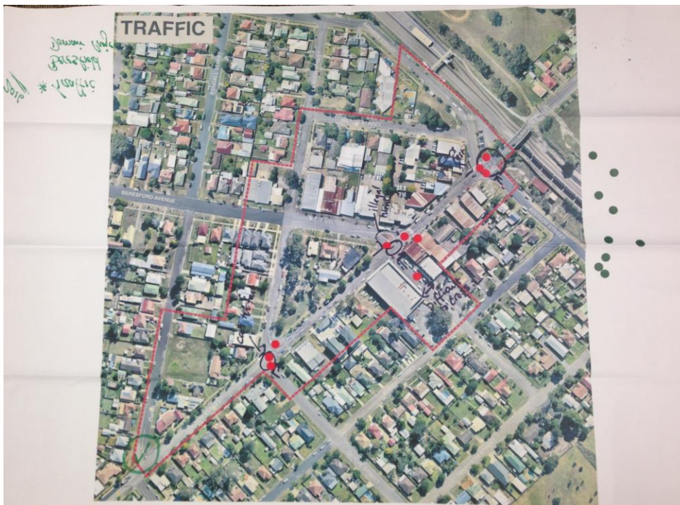
Figure 2: Beresfield map work

Six aerial photo maps were used in the workshop for people to spatial locate their issues and ideas relating to each of the major project themes. An example is provided in figure 2.