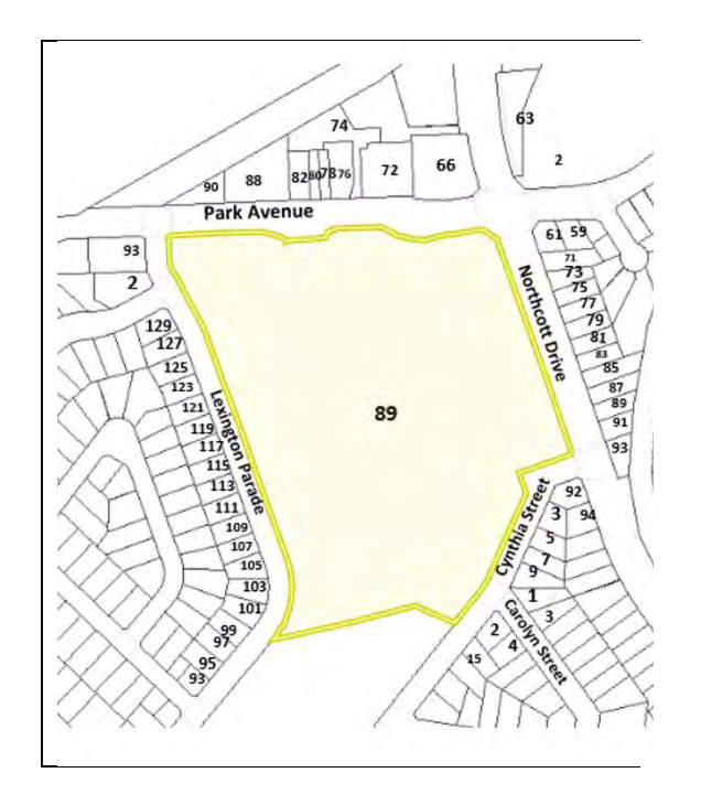
Subject Land: 89 Park Avenue Kotara

The proposed modification application seeks consent to extend the closing times of the Cynthia Street and Lexington Parade driveways until 10.00pm every day.