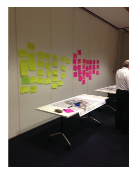
Table 1: What I like about Wallsend sticky notes