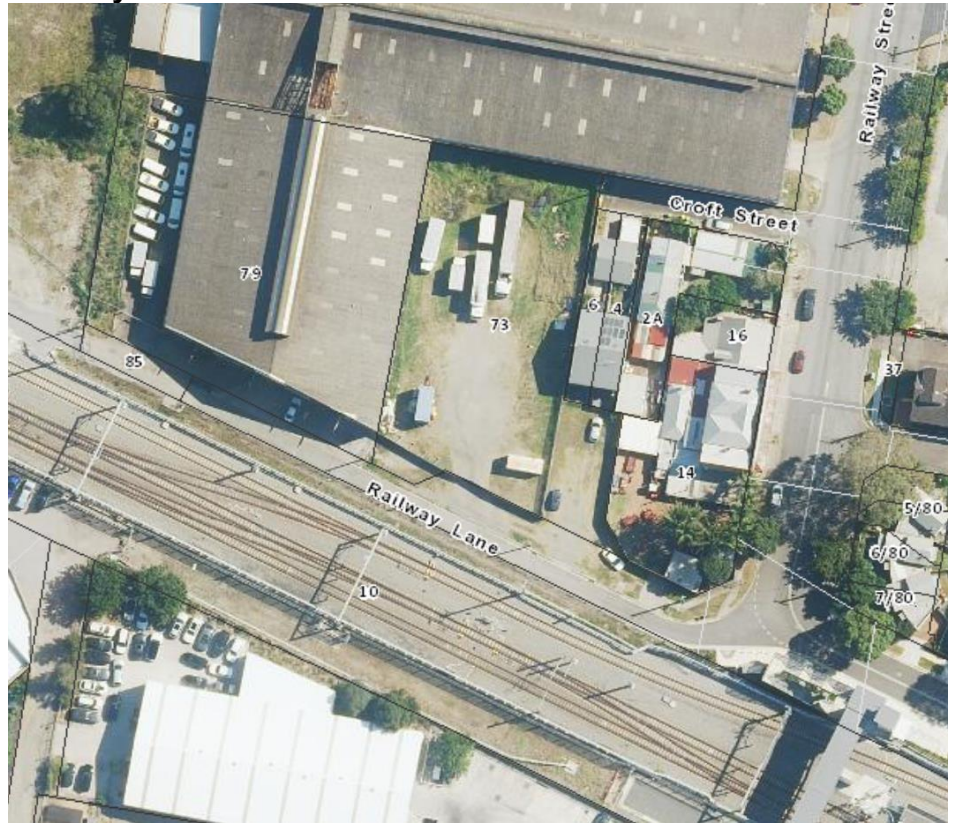
Figure 1 Railway Lane width

It is advised that the original approval (DA2016/00384) involves significant public domain works including reconstruction part of Railway Lane, footway works, new kerb and gutter, street lighting, street tree planting and the dedication of land as currently Railway Lane is effectively a single lane width (see Figure 1 below) and the remainder is currently private land. The required land dedication will achieve an effective two-way roadway width in the short-term and would further allow for a link road from Maitland Road, Islington to the Wickham area in the future. Finally, it is advised that all these public domain works are in addition to both the required Section 7.12 contributions and the applicant's proposed Voluntary Planning Agreement.