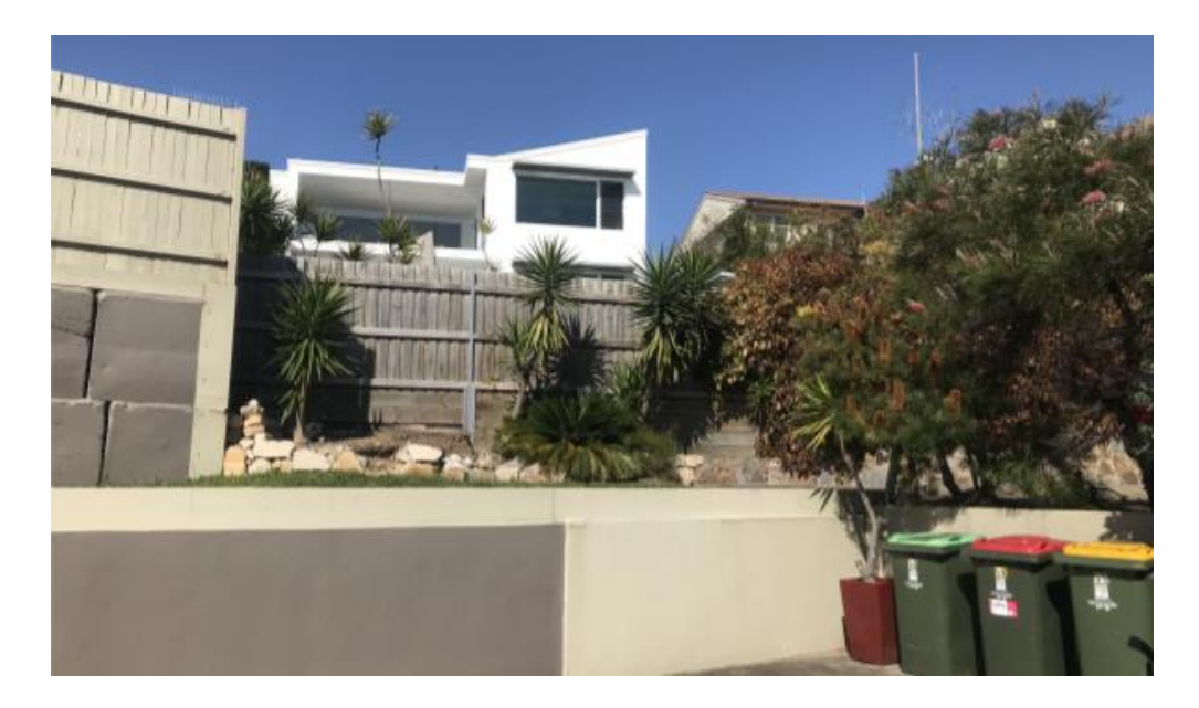
Figure 3: The rear of 26 Hickson Street, has slightly higher floor levels than 28 Hickson Street and has a rear deck area on the upper level overlooking the subject site. A pool and deck area are located on the ground level of the site.