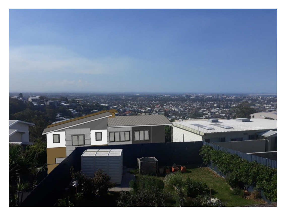
Figure 2 – Northern view towards subject property from southern property at 28 Hickson Street Merewether - upper level deck (from a standing position) taken by CN's Assessing Officer on 15 October 2020. Architect has superimposed an image with the approximate height and location of the proposed additions at 59 Scenic Drive Merewether.

Figure 1 – Northern view towards subject property from southern property at 28 Hickson Street Merewether and expansive distant city views - upper level deck taken by CN's Assessing Officer on 15 October 2020.