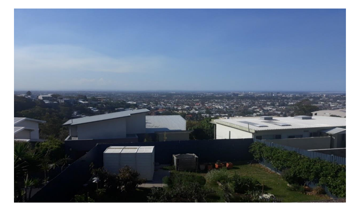
Figure 1 – Northern view towards subject property from southern property at 28 Hickson Street Merewether and expansive distant city views - upper level deck taken by CN's Assessing Officer on 15 October 2020.

Extraordinary Development Applications Committee Meeting 08 December 2020 Page 8