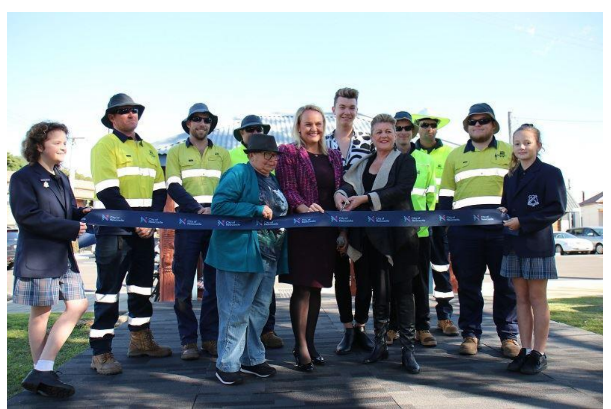
The Lord Mayor opening the upgraded Carrington Local Town Centre with the help of City staff, locals and students

The local centre overhaul was marked by the City staff and locals in Jubilee Park this morning.