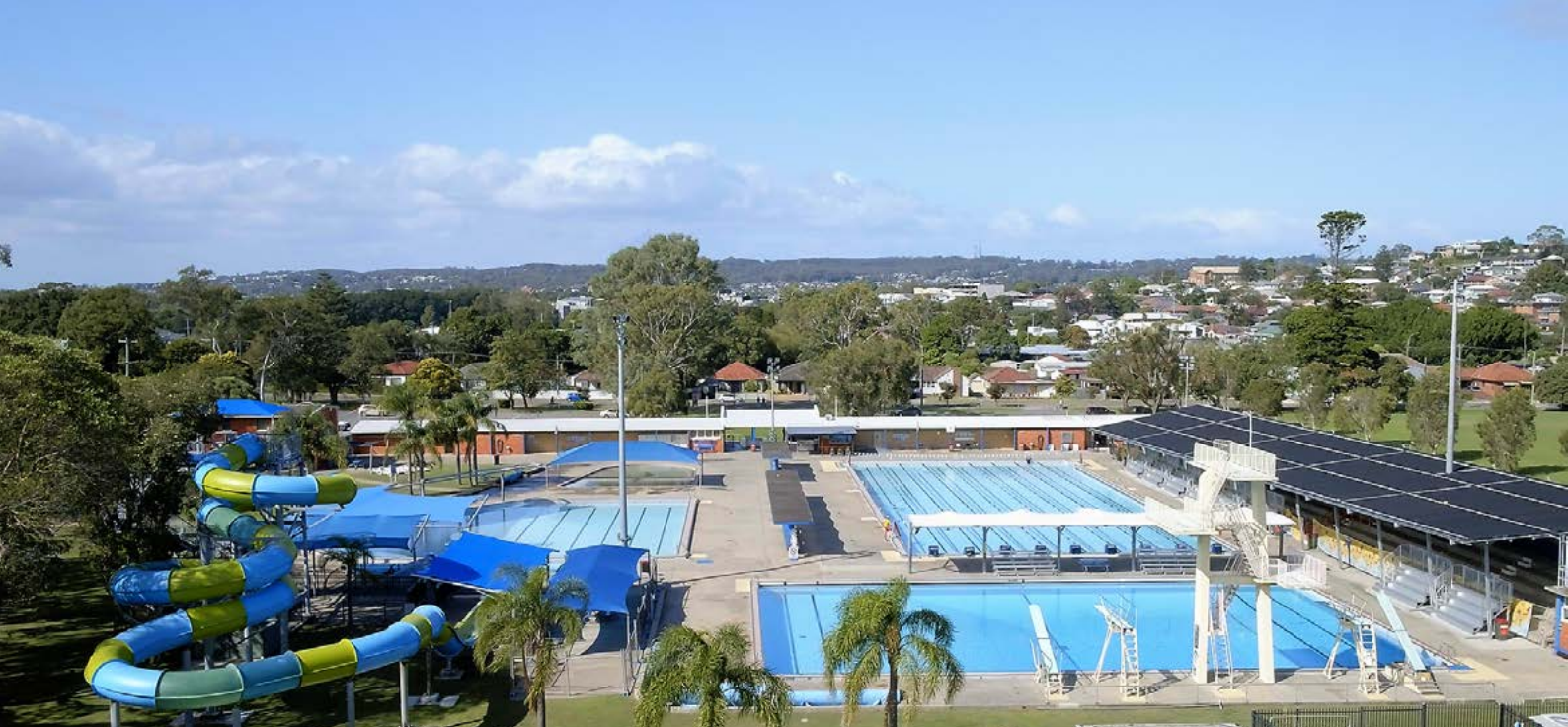
Work is continuing on construction of a new grandstand at Lambton Swimming Centre.