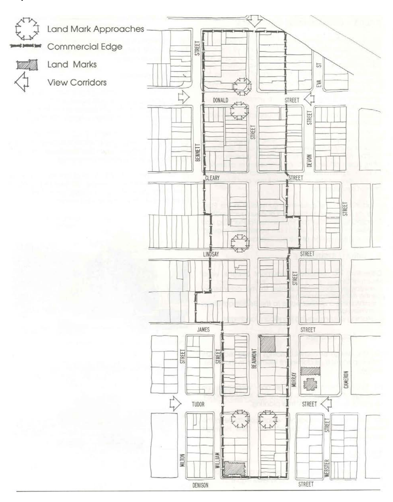
Map 2: Landmarks and view corridors