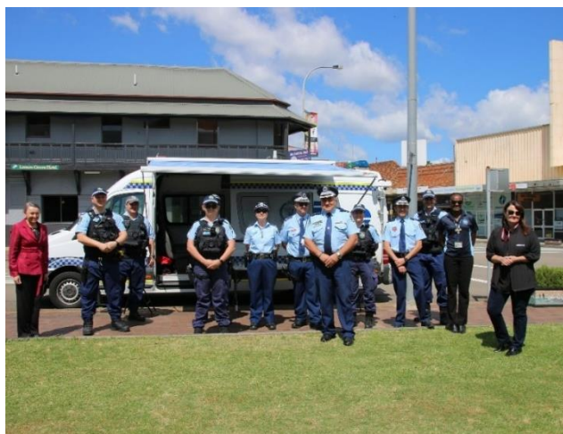
The launch of Business Beat in Wallsend in October 2020

A city wide collaboration to connect local business and local law enforcement