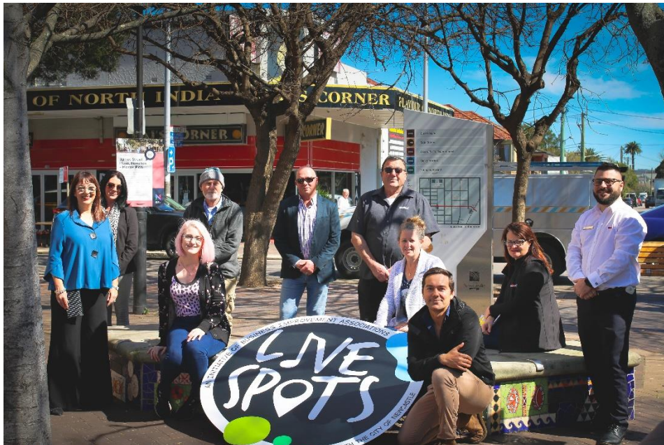
Soft Launch of Live Spots in August 2020

A city wide collaboration to enhance live music