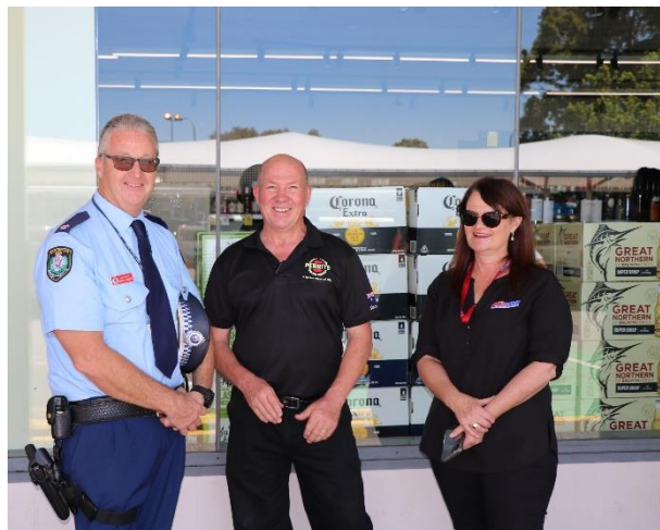
Mayfield's launch of Business Beat in November 2020

The Business Improvement Associations (BIAs) of Hamilton, Newcastle City, Wallsend and Mayfield launched a collaborative initiative with Police Local Area Command in September 2020 that delivers a series of visits by police officers into business precincts.