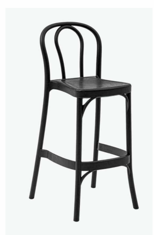
STACKABLE BAR STOOLS