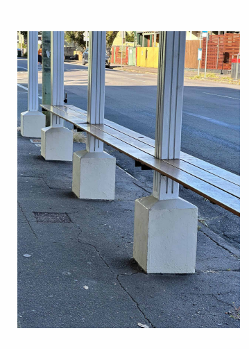
FIXED OUTDOOR BAR TABLES OILED NATURAL TIMBER SLATS WITH POWDER COATED STEEL SUPPORTS